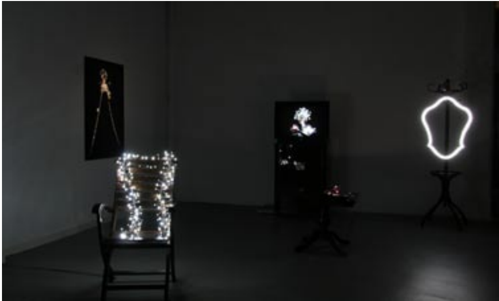
a video playing on a monitor presents Electra with her luminescent accessories

For Electra's World , my solo exhibition at the Galerie Synopsis in Lausanne, I allow the audience to have a peek at the fictional world of my character, Electra. I unveil staged scenes using photography and video as well as luminescent objects within the space.